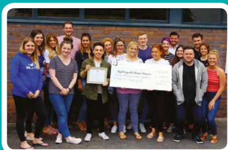
Sizzix Lifestyle climbed Snowdon and raised £4,936.72