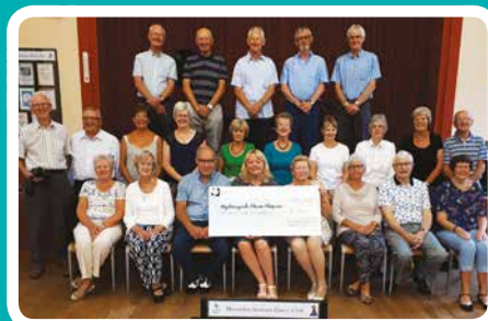
Hawarden Institute Dance Club raised £1,000