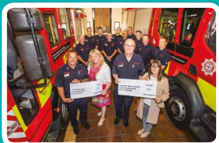
Mold firefighters kindly donated £750