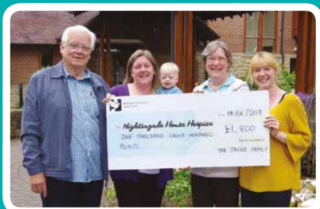
The Davies family took part in this years Heritage Walk raising £1,800