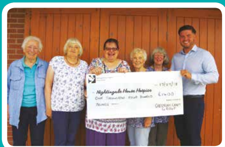
Gresford Craft Group raising £1,400