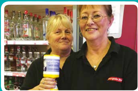
Bargain Booze in Mold fill their tins so quickly!