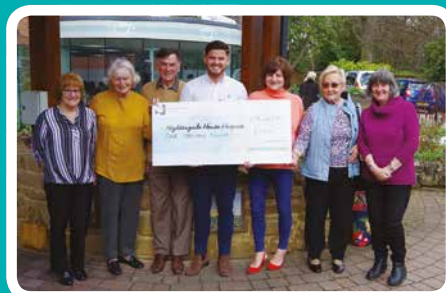
Lavister Friendship Group held a coffee morning raising £1,000