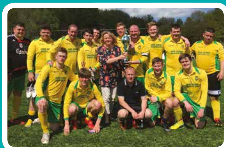
The Village Bakery held a charity football match for our hospice