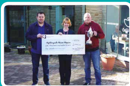
Cadbury Mondelez organised a football match raising £1,995