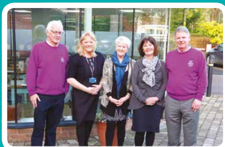
We are Mold Golf Club's charity of the year 2018