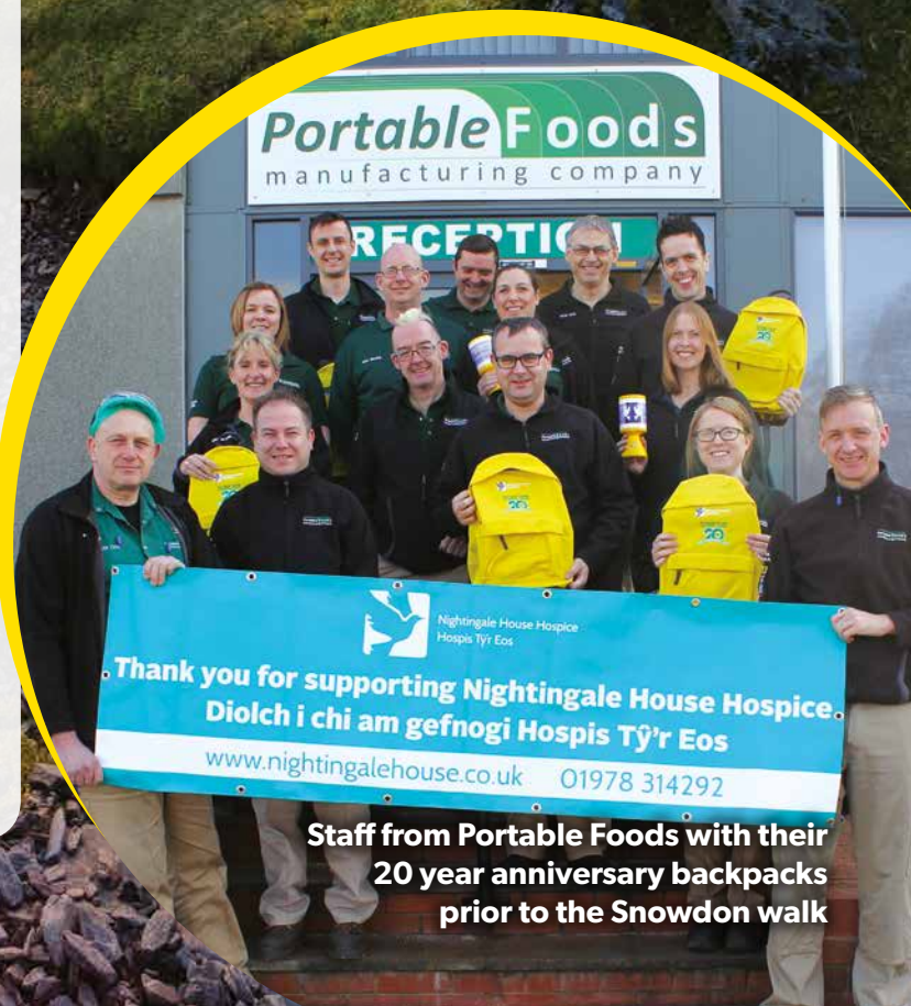
Staff from Portable Foods with their 20 year anniversary backpacks prior to the Snowdon walk

More information on the Snowdon walk a fundraising page has been set up at: justgiving.com/portablefoodssnowdon