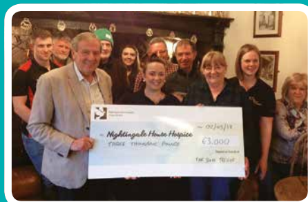
The quiz goers at The Sun, Trevor have raised £3,000