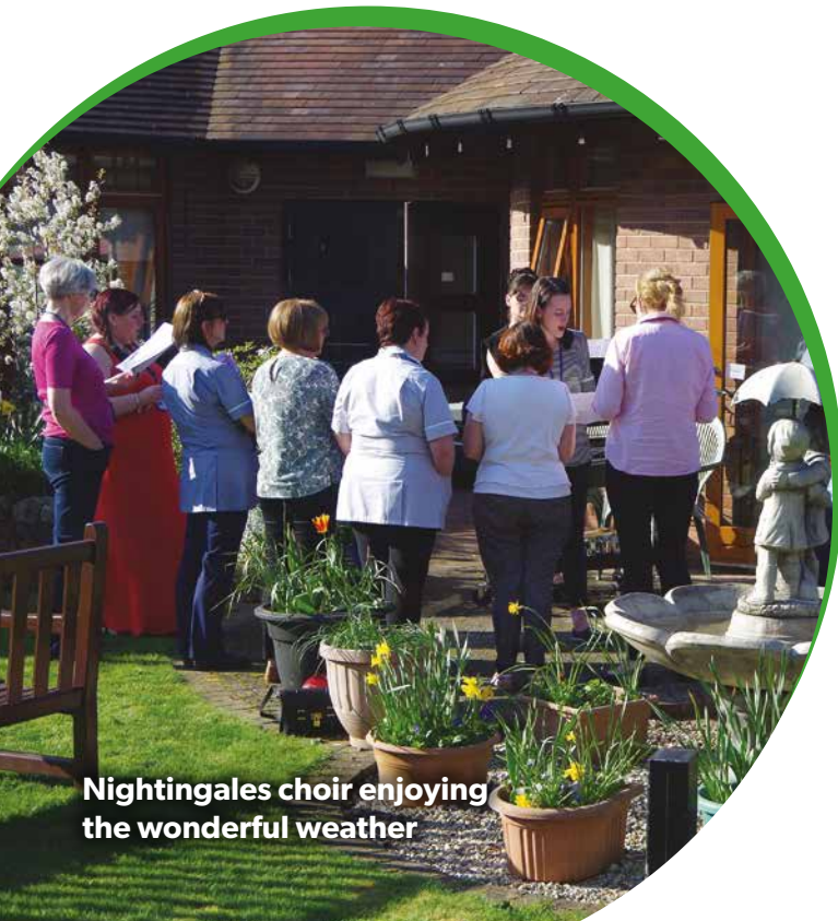
Nightingales choir enjoying the wonderful weather

Originally our staff, volunteers and board members wanted to entertain our patients and their families at Christmas, so formed a choir called 'Nightingales'.