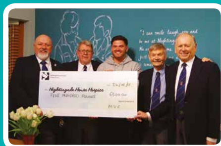
The Fron Male Voice Choir donated £500 from a recent concert